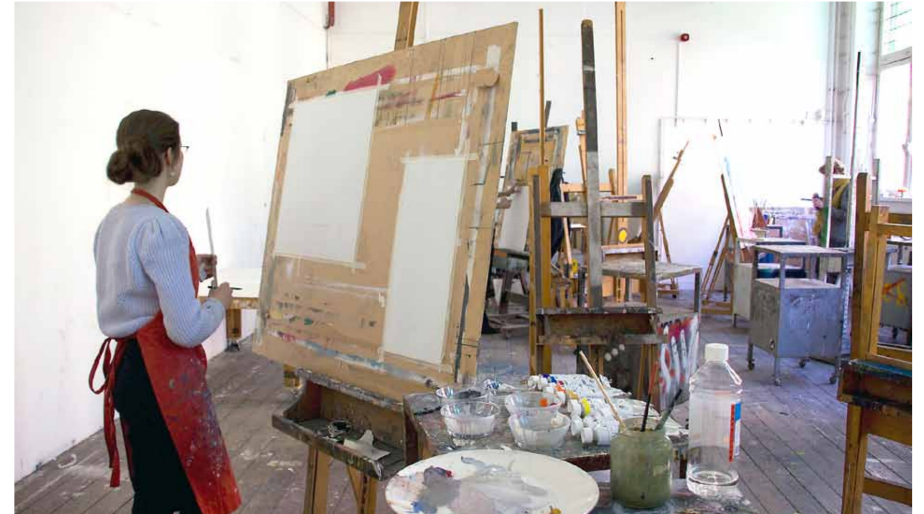
A course on artistic research for examples covers new and innovative aspects within the artist world

The bachelor Fine Arts is an art study programme that allows students to study and develop different mentalities within the entirety of fine arts, a diversity which is also reflected in the team of lectures and teachers. ■