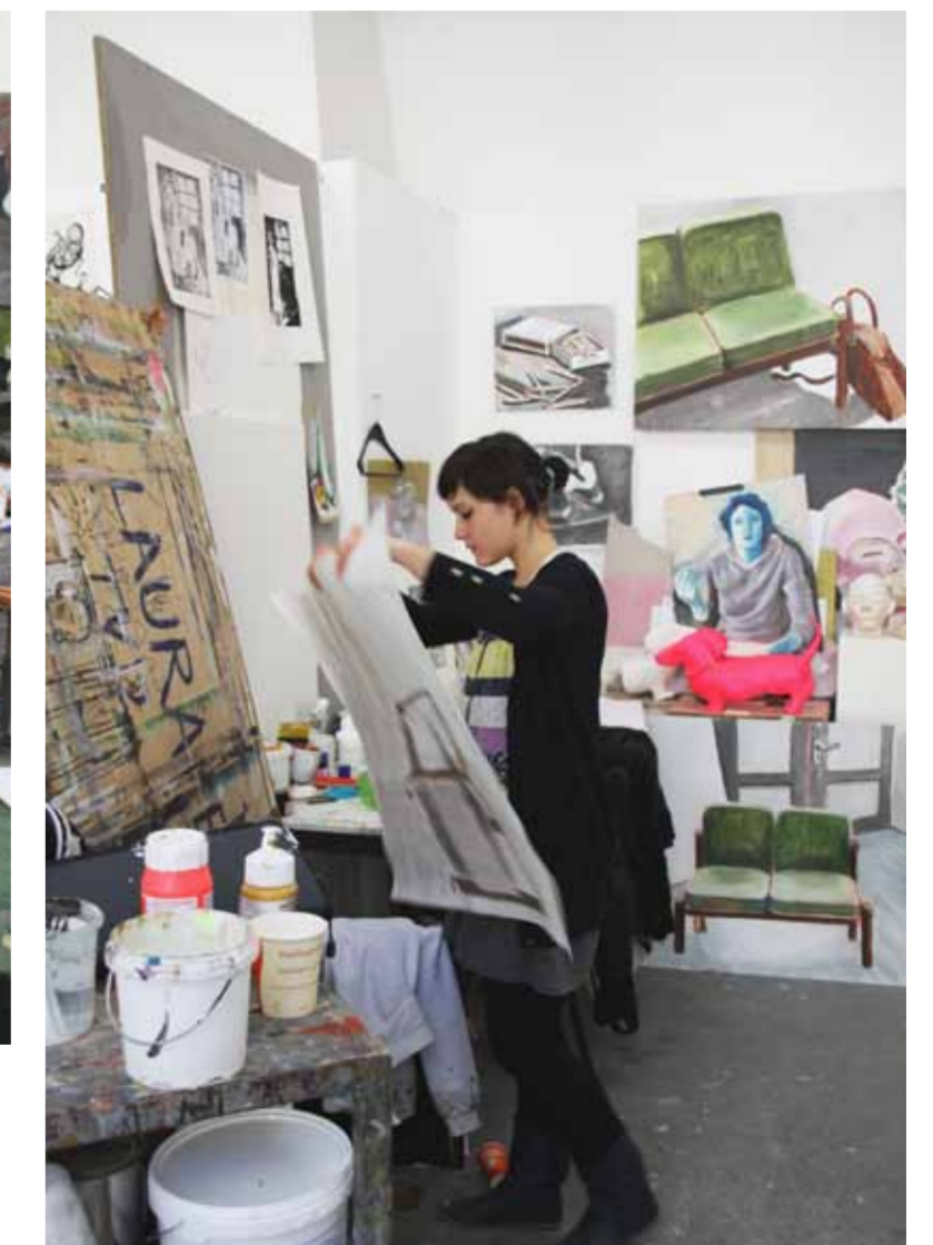
The students' conceptual approach to their work becomes increasingly important during their studies